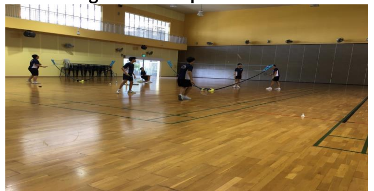
Badminton at MPH